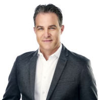
President of Haycor Computer Solutions Inc.

Our Mission: To build strong, long-lasting relationships that surpass professional formalities by catering our services to each customer's specific needs.